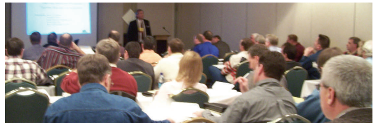
User group seminars held around the United States at the major conventions. These are excellent sources of information and fill up fast.

We highly recommend your attendance at the seminar nearest you. This is RCC’s Commitment to clients. We believe that a little training today will lead to a more efficient tomorrow!